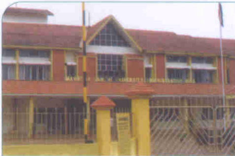
Administrative Block of MG University