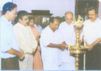
Declaration of TIS Completion Workflow implemented in 194 Treasuries