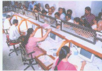
Computerised Treasury Counter

Treasury Information System (TIS) is a workflow based transaction processing system, which forms the foundation for TRIM. TIS takes care of all payment and receipt transaction processing from counter level to accounting stage. TIS is implemented in all 194 Treasuries of the State.